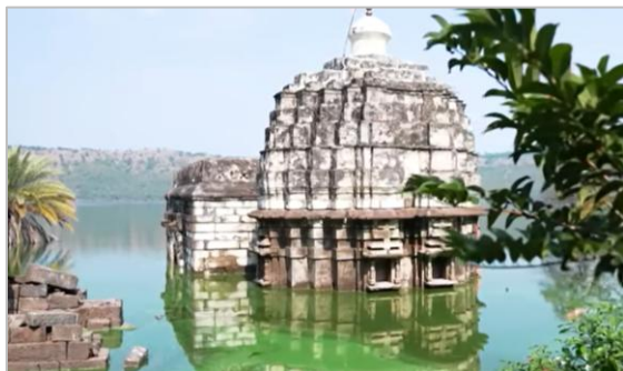
Figure 1: Kamalja Mata Temple within the Lonar crater complex, illustrating its historical significance and increasing exposure to inundation during periods of elevated lake water levels.

In recent years, however, this long-standing equilibrium has been disrupted. Rising lake water levels have resulted in periodic inundation affecting parts of the Kamalja Mata Temple , particularly during high-water episodes. This development marks a critical shift: hydrological change is no longer an abstract or distant process, but one that directly threatens a living heritage structure. The encroachment of lake water onto temple precincts highlights the vulnerability of culturally significant sites to changing subsurface and surface hydrological regimes.